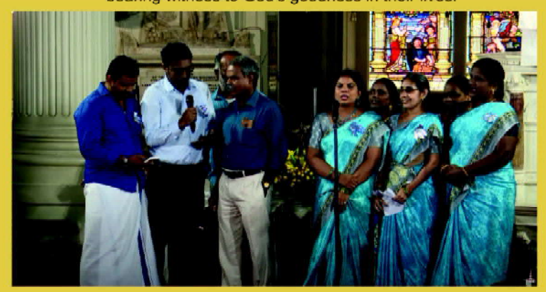
The Parents of Egmore ASHA praising God