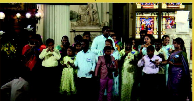
The children of the Egmore ASHA singing.