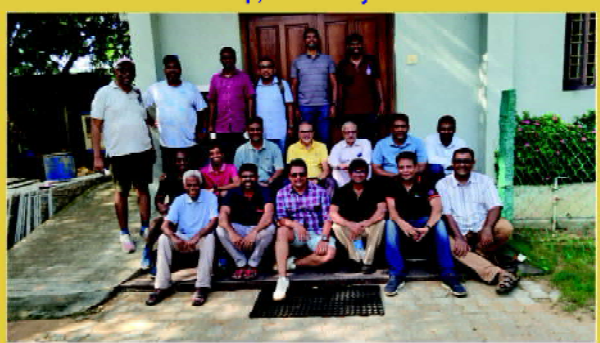
It was a time of worship, fellowship and fun by the sea as the Kirk's Men's Fellowship took a day out at Mamallapuram

It was a Sunday of a different kind as 19 men from the Kirk including a few guests carpooled and headed to Mamallapuram on August 20th for a day long picnic at the Scripture Union camp site.