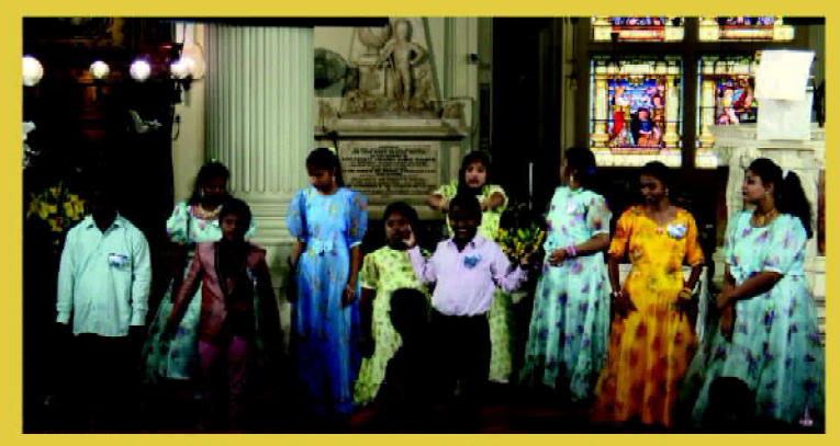
The children of the Egmore ASHA presenting a dance