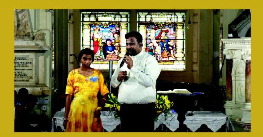
Pastor with Joshua Message on 'Bond beyond blood'