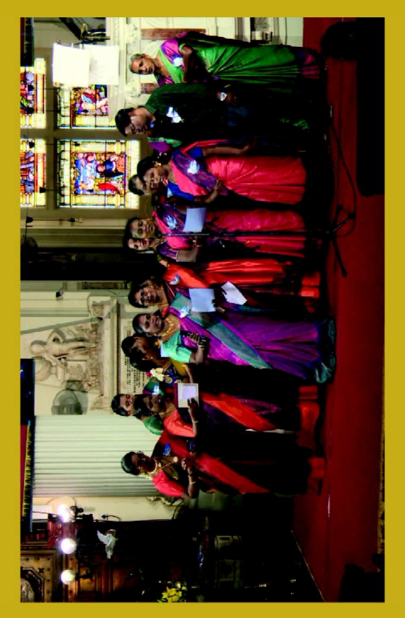
The Staff of ASHA thanking God for his grace