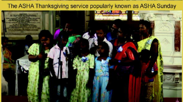
The children of the Thirupalaivanam ASHA centre