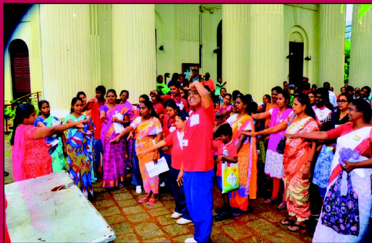
Independence Day celebrations in the campus of The Kirk