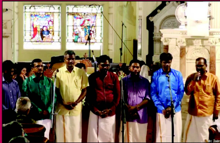
Evangelists singing a song asking everyone to share the gospel at the Evangelism Sunday service on 26th August