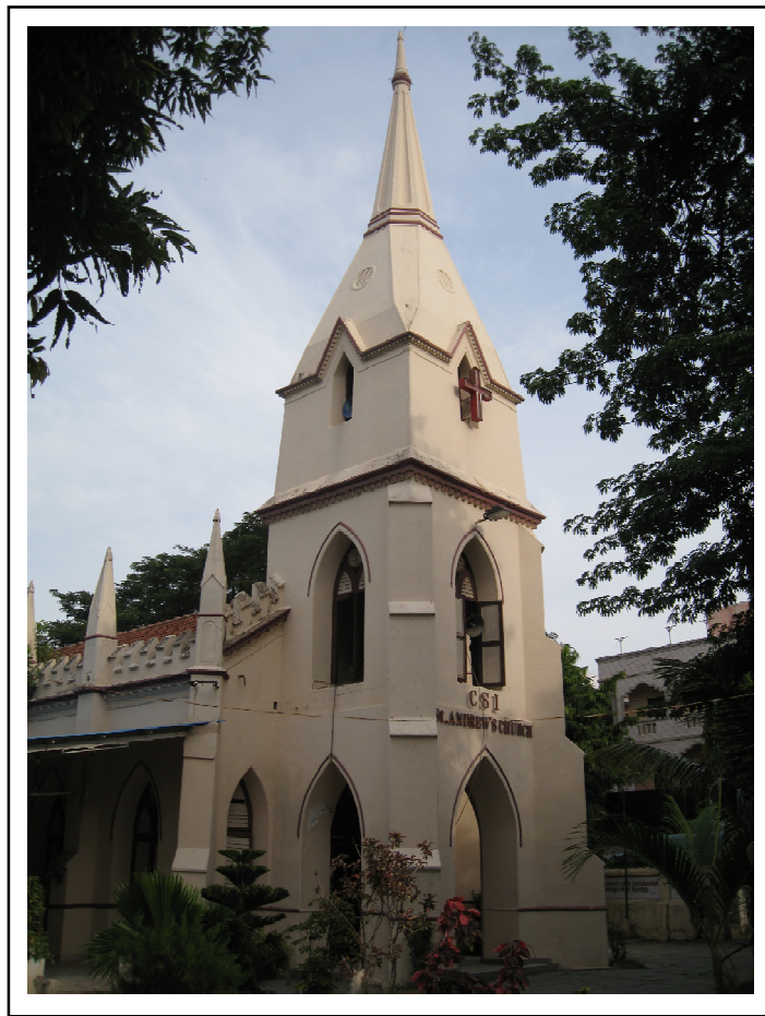
St. Andrew's Tamil Church, Choolai, Chennai - 112. (A.D. 1837)