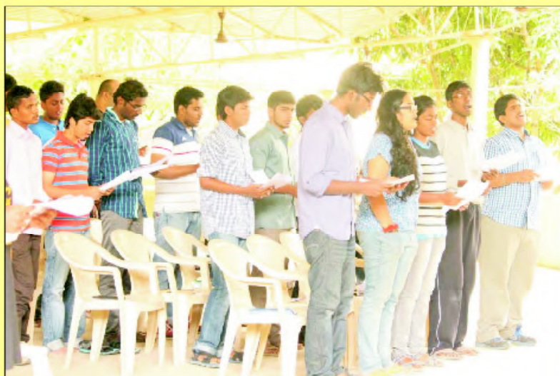
Photos from the KYF Annual Camp at Bangalore