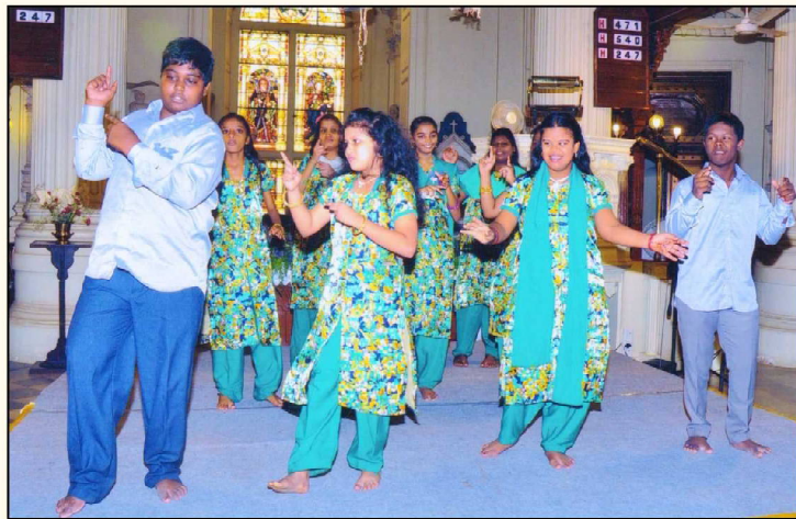
Asha children performing on Asha Sunday