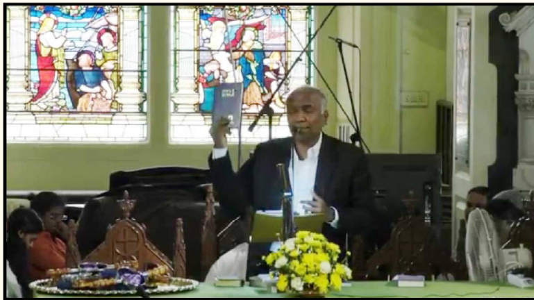
Changed lives - Gideons' testimony