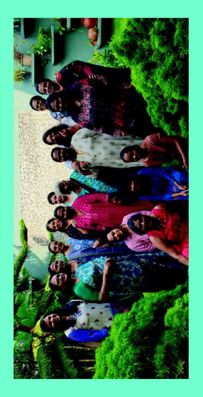
Kirk Women's Fellowship Retreat 2023