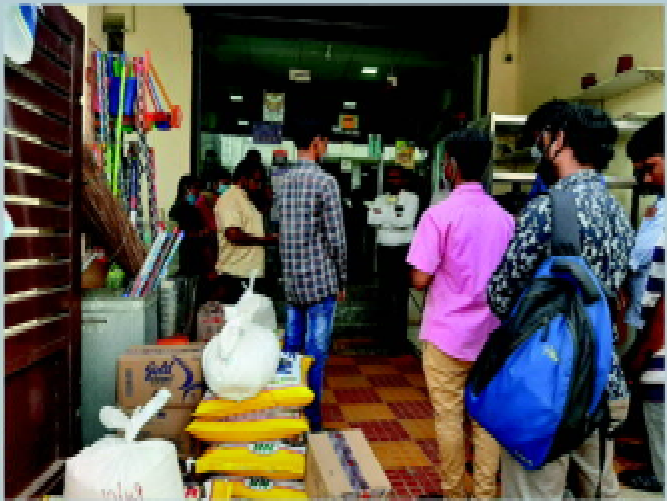
Distribution of Thanksgiving gifts to needy organisations during the 1st week of October.

48: 04 November 2020 THE MAGAZINE OF ST. ANDREW'S CHURCH (THE KIRK), CHENNAI