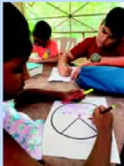
Craft based on Psalm 1 by Primary

The Inters made cross-shaped bookmarks to depict John 1:16. Each gemstone stands for a different part of the gospel: the darkness of sin (black); the blood of Jesus shed for us (red); forgiveness of sin (white); baptism (blue); growth as a Christian (green); eternal life and heaven (yellow).