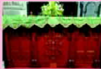
Communion Table (Altar) at St. Andrew's Church - The Kirk (Chennai)

A historical narrative with a timeless perspective