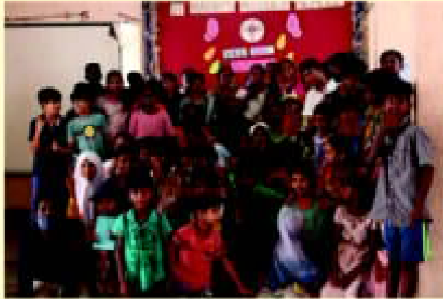
VBS at St Mark's School