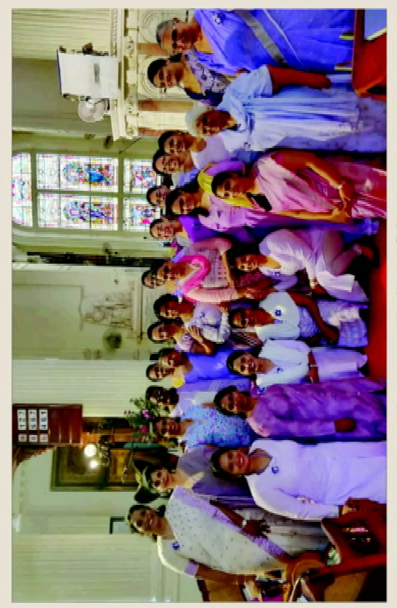
In the sanctuary - Kirk Women's Fellowship