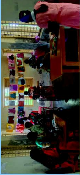
Village Project Tailoring Unit & Course Completion Certificate