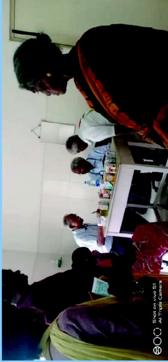
Village Project Medical Camp