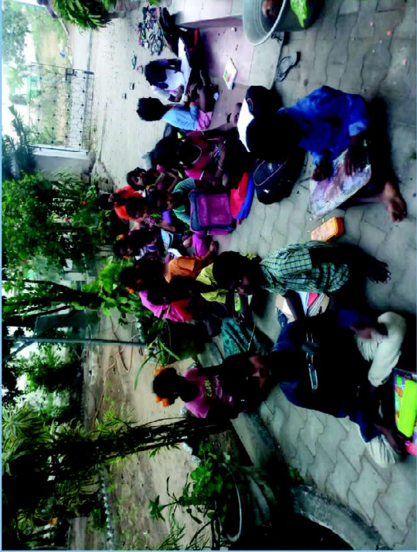
Village Project Evening Tuition