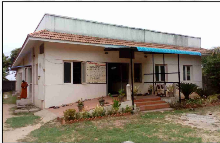
The Chapel and Clinic at Tirupalaivanam