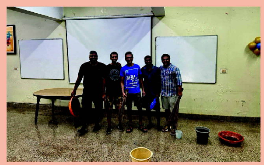
Clean up of SACCE Hall by Men's Fellowship volunteers post the recent floods