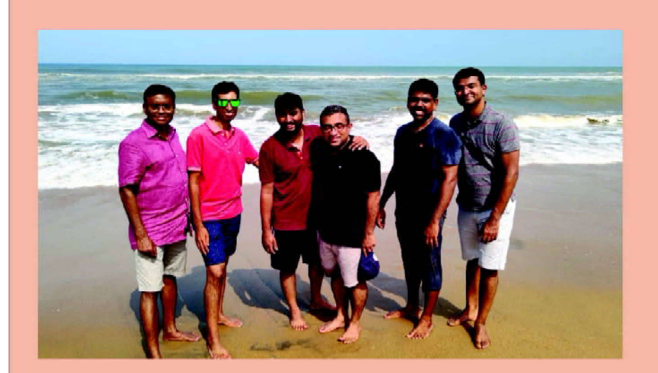
KMF Picnic at Mahabalipuram