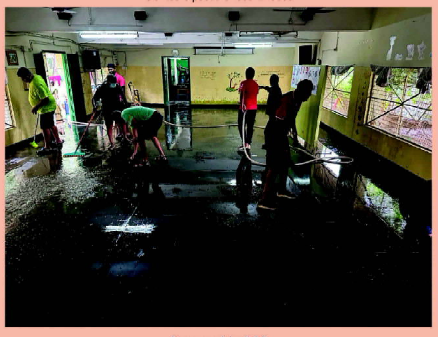
Clean up of the DCC