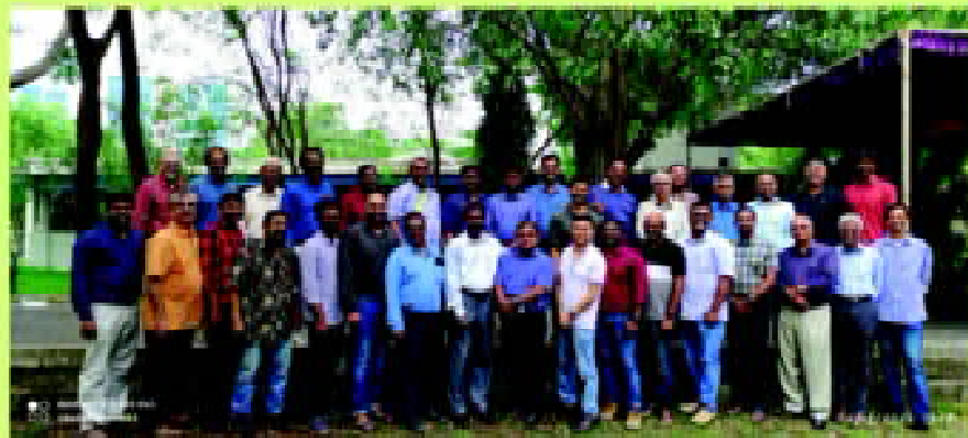
Men's Fellowship Christmas