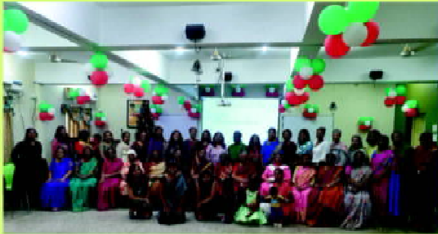
Women's Fellowship Christmas