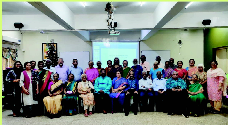
Elderly Christmas Get-Together