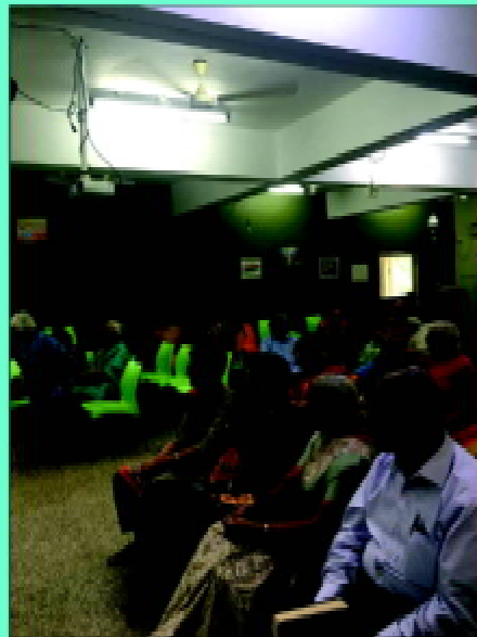
Christmas get-together for the elderly