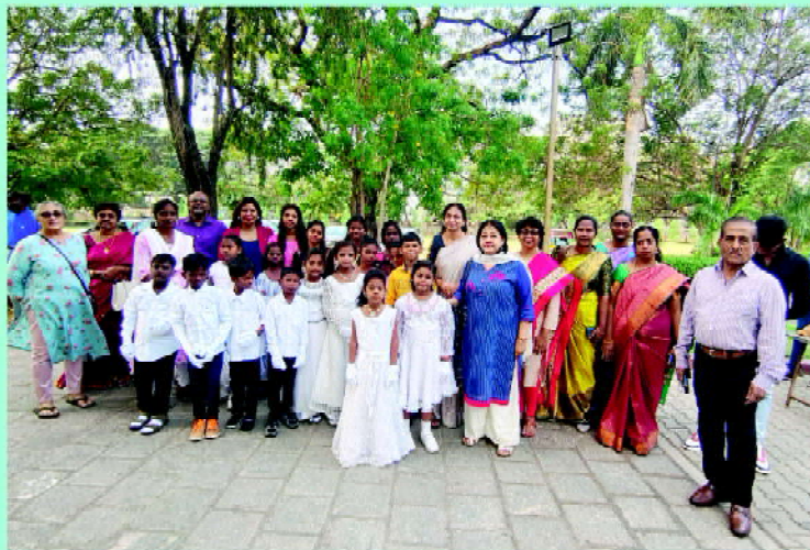
A happy gathering with AKCDC children