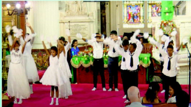
Children performing a lively dance and song