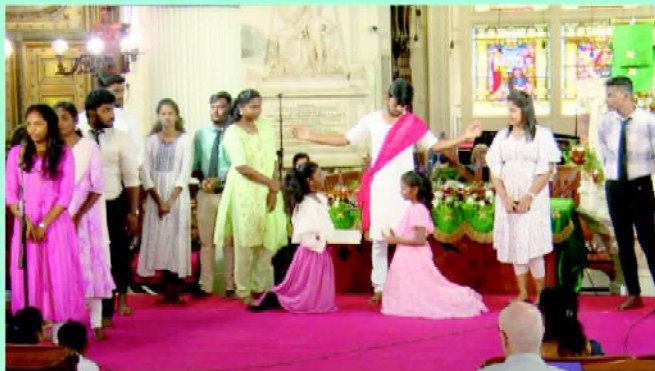
Performing a skit