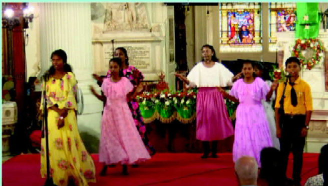
Children singing and praising God