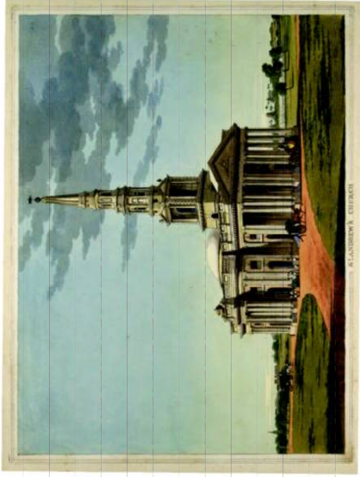
ST. ANDREW'S CHURCH