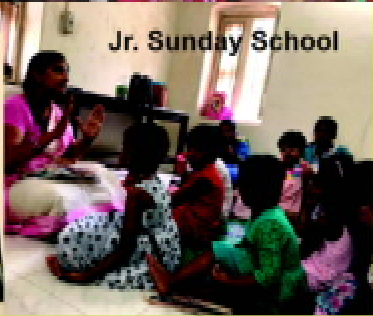
Jr. Sunday School