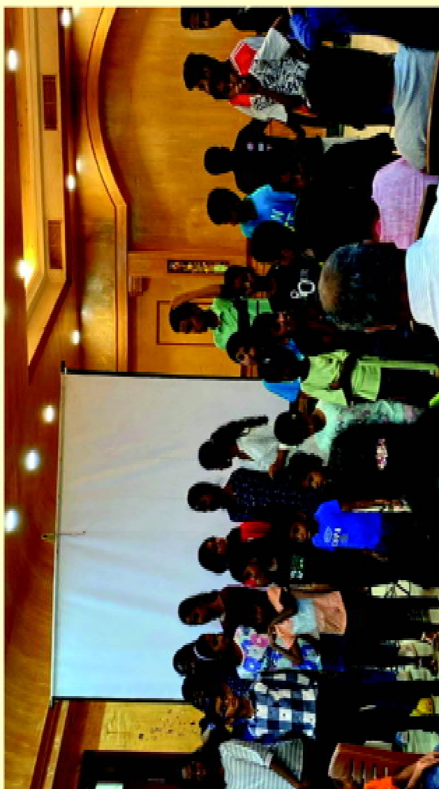
CHURCH CAMP - 15 TH & 16 TH , JANUARY 2020