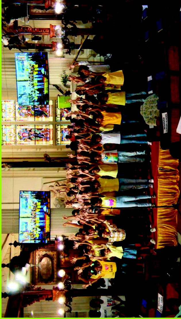
Sunday School Sunday Program