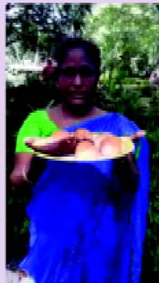
Online class - 'Five Loaves And Two Fish'