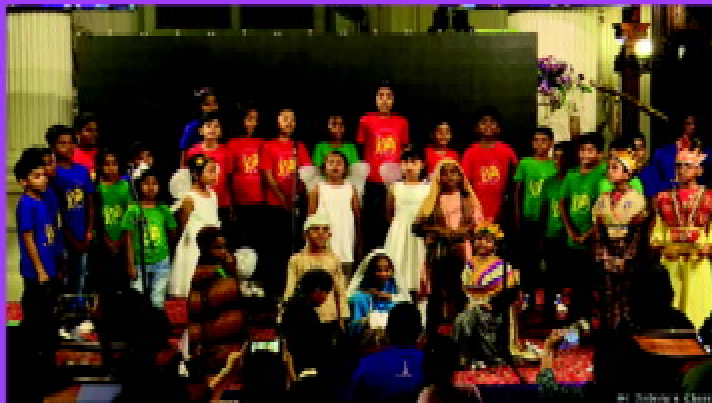
SUNDAY SCHOOL CHRISTMAS PLAY 24th NOVEMBER