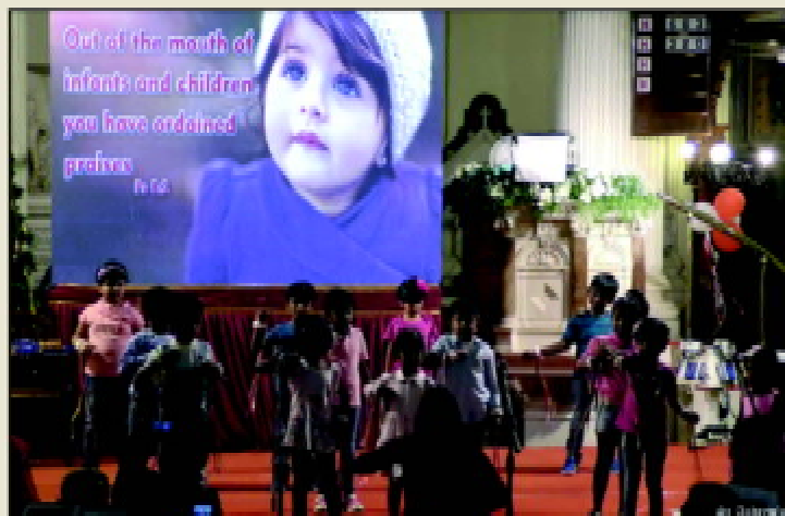
Sunday school Christmas programme 25th November