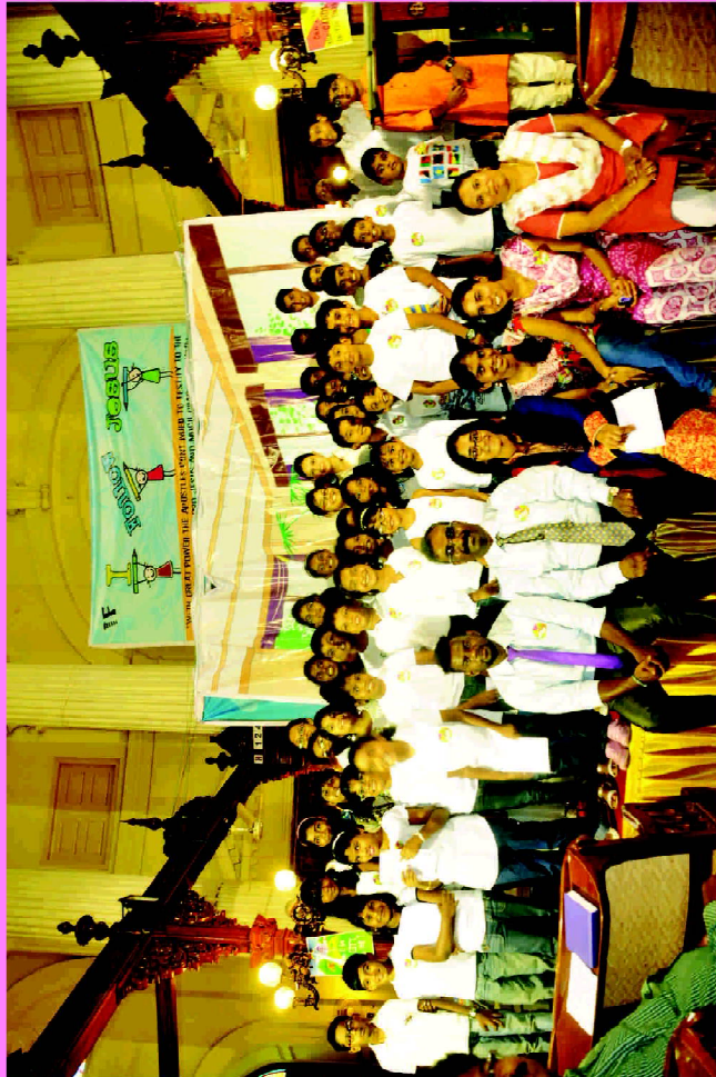
Presenters of "Children's Sunday"