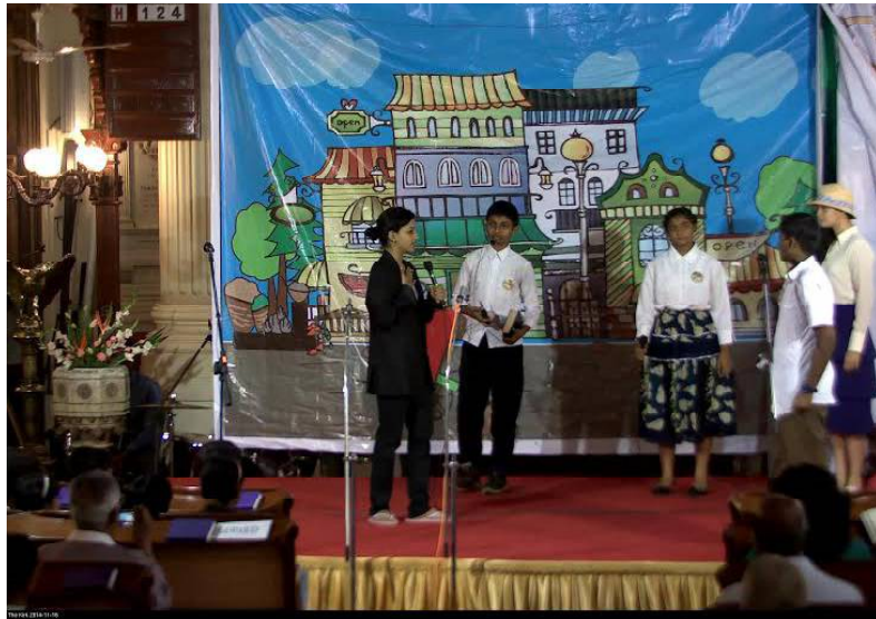
A scene from the play on William Carey