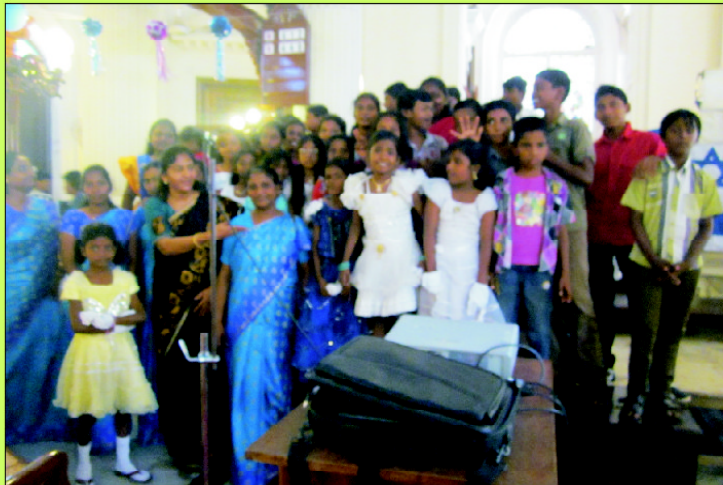
AKCDC - a joyful celebration