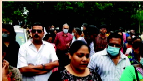
An eager thronging to the Kirk Carnival!