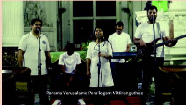
Parama Yerusalame Paralogam Vittiranguthae