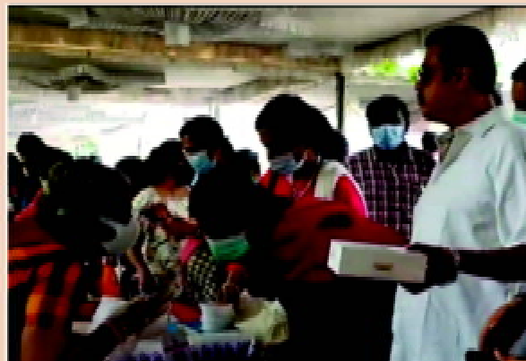
Sale of delectable eats