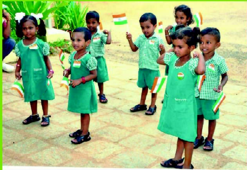
RMDCC - Young Patriots