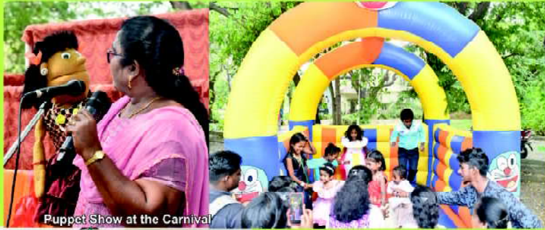
Puppet Show at the Carnival