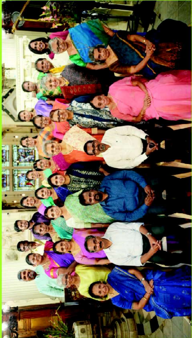
RMDCC Committee Members and Staff with Pastors and Kirk Secretary