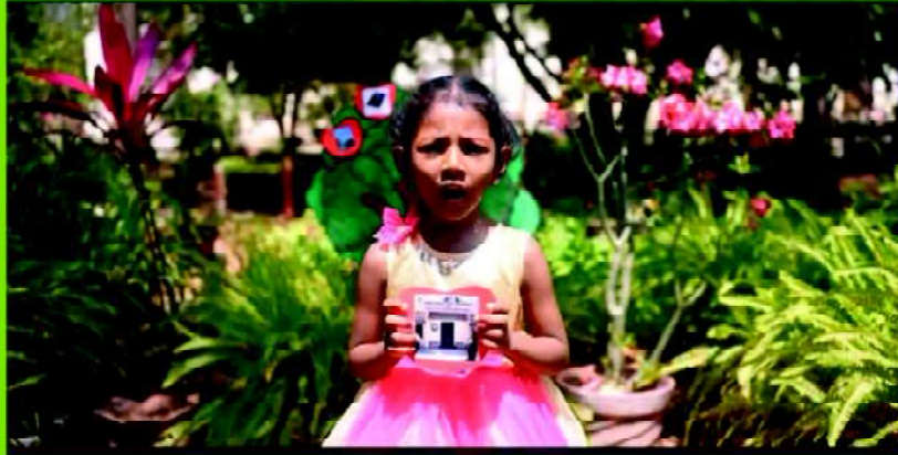
RMDCC - What are you thankful for