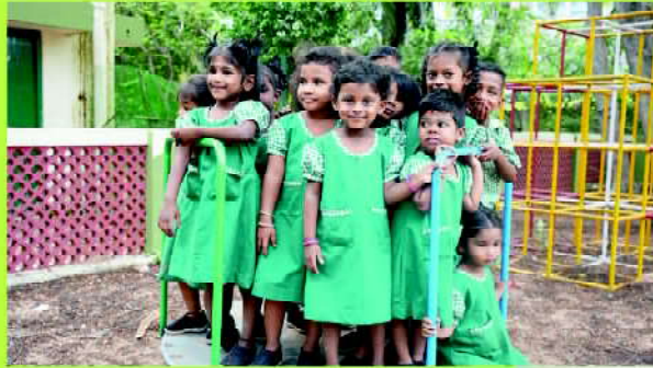
Enjoying the playground