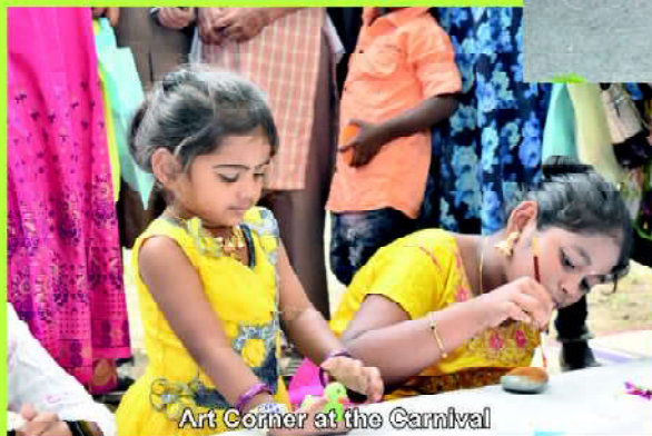
Art Corner at the Carnival