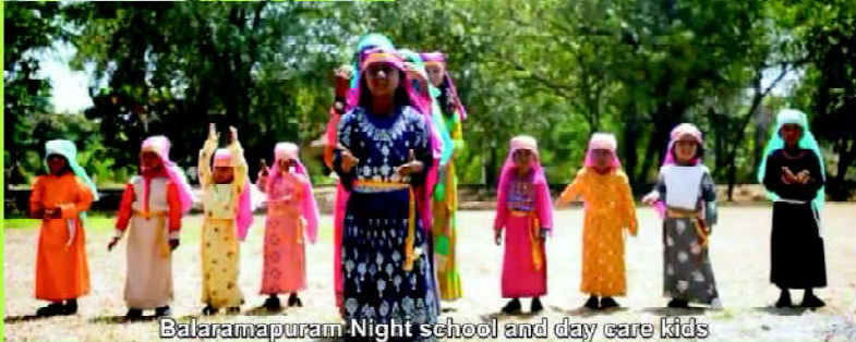
Balaramapuram Night school and day care kids