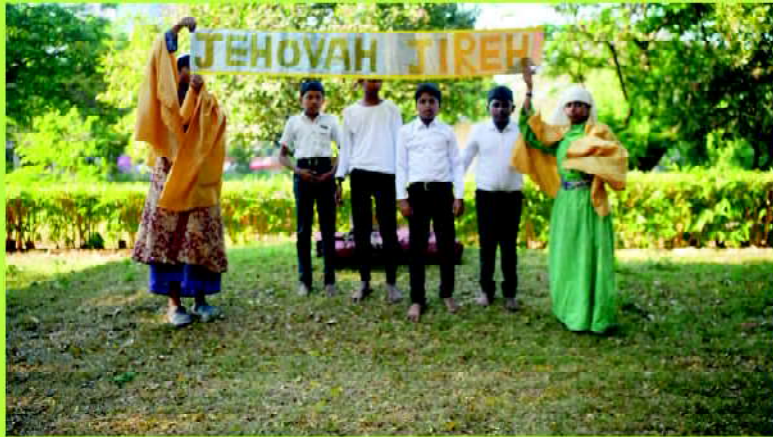
SACRIFICE Song by St Mark's Night School