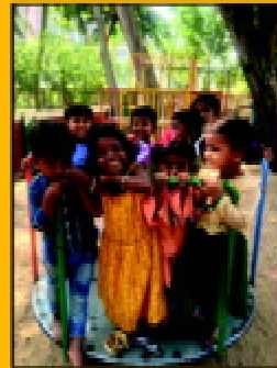
Happy Play time