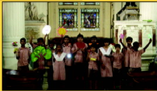
Night School Perlamet