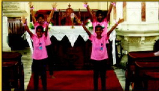
Night School Balaramapuram