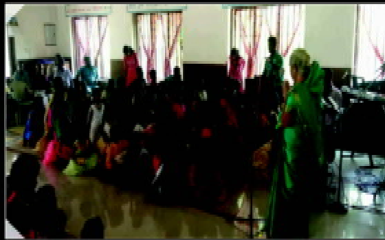
THIRUPALIVANAM CHURCH ANNUAL CELEBRATION